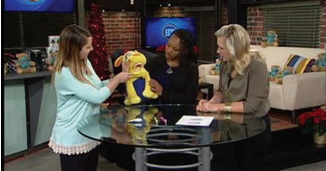
STEP students on Breakfast Television Winnipeg