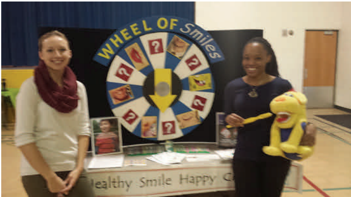
STEP Students participate at the Brooklands School Health Fair