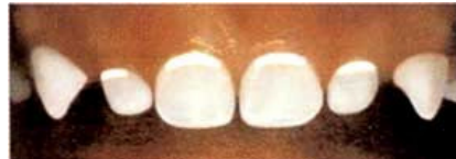
Whitish lines along the gum line.

Decay looks like white, brown or discolored areas on the teeth, often along the gum line.