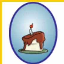
First Dental Visit by 1st Birthday