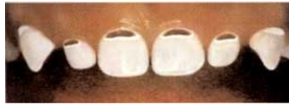
Brown areas or decayed spots along gum line.