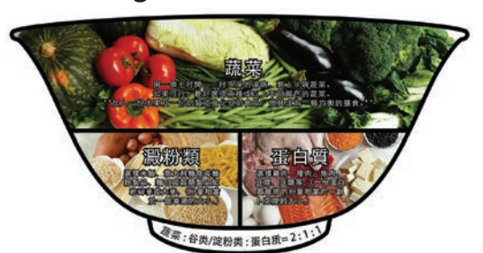
Grains and starches potato, pasta, noodles, rice, corn