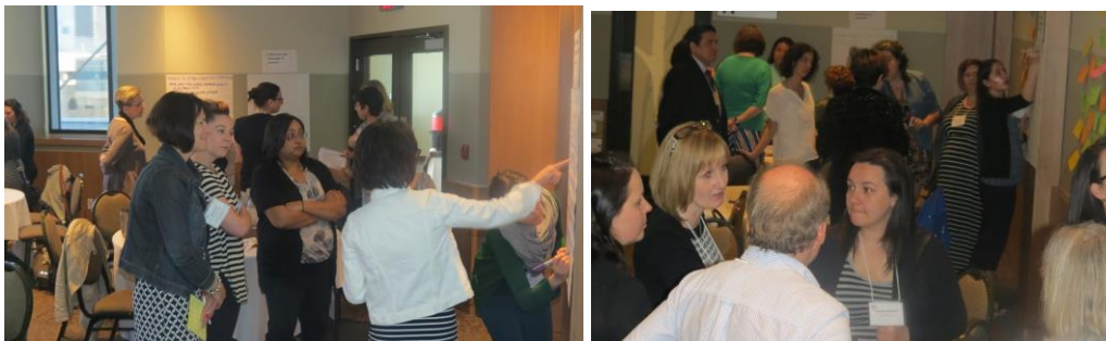
Gallery Walk Activity for participants