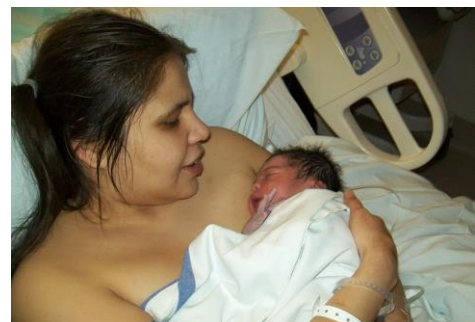
Reflecting on the work of PIIPC.